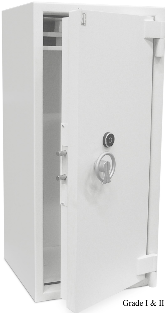
Grade I & II