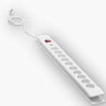
Power strips with 10 outlets

We reserve the right to alter the specification without prior notice.