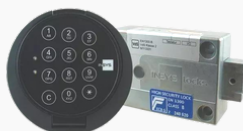
Electronic combination lock* Insys combilock 200 simplex