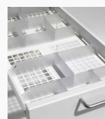
Movable plastic dividers

Two stickers are supplied with the security drawer, one should be placed on the unit and the other one should be placed at the entrance.